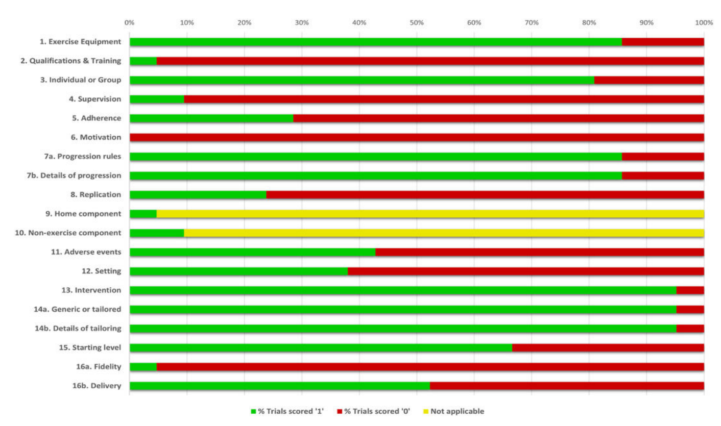
Figure 4. Summary graph of results for the reporting quality evaluation: % of trials rated by each Consensus on Exercise Reporting (CERT) domain.

as 'slow and controlled' and 'slow to moderate' concentric velocities, respectively.<sup>60,83</sup>