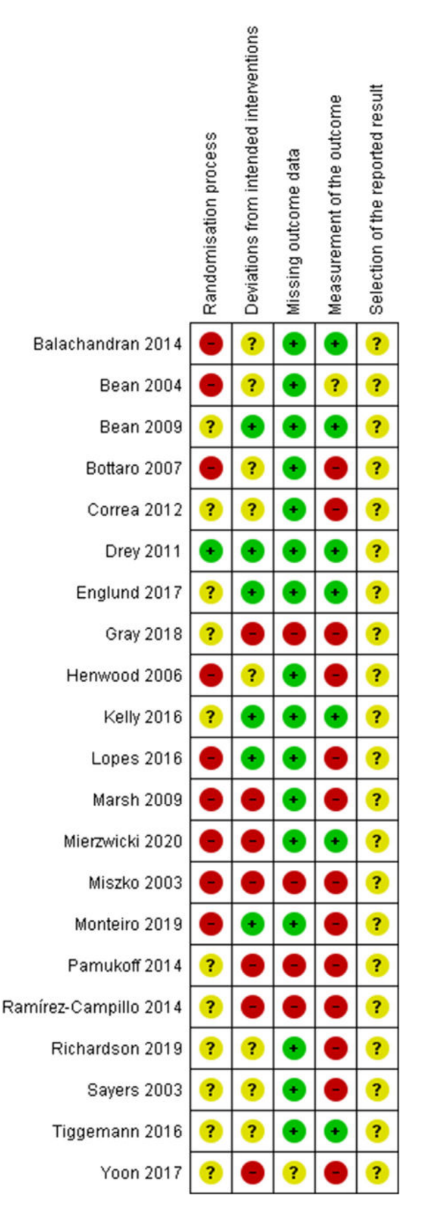
Figure 2. Authors' judgement of methodological quality using the Cochrane Risk of Bias 2 tool.

overall risk of bias and five (24%) were deemed as having some concerns. No trial was judged as having a low overall risk of bias.